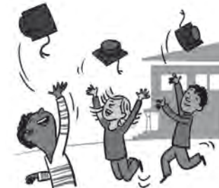
6 feel _____

2 ☆☆ Complete the phrases with the verbs in the box.