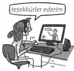
4 learn _____