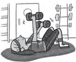
5 get _____