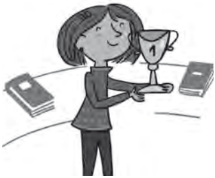
1 win a competition

a competition a language famous fit friends happy