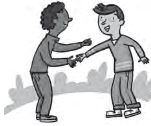
2 make _____