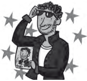
3 be _____