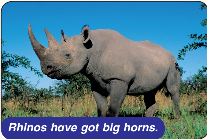
Rhinos have got big horns.

Some animals have got horns or beautiful fur. People hunt them for these things.