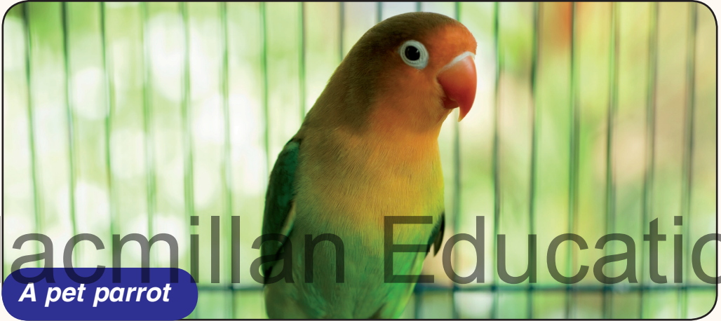
A pet parrot

Hunters catch some animals because they are pretty. They sell them as pets.