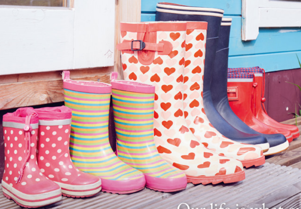
A collection of wellington boots.